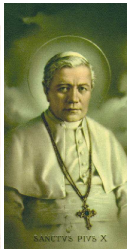
Pope St. Pius X +1914